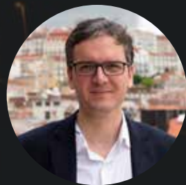
Miguel Gaspar Deputy Mayor for Mobility & Safety, City of Lisbon

You are all invited to be part of the change.