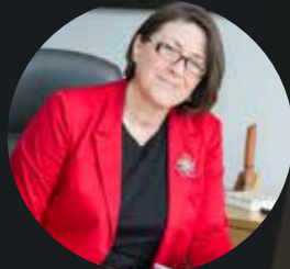
Violeta BULC European Commissioner for Transport

It will be a great pleasure for us to welcome you next year, for the European Congress on ITS 2020 to be held in Lisboa for the first time.